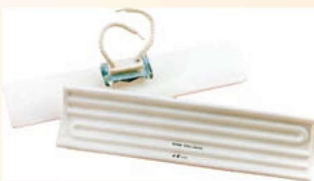
Common dimensions for models OSC and OSCxxK